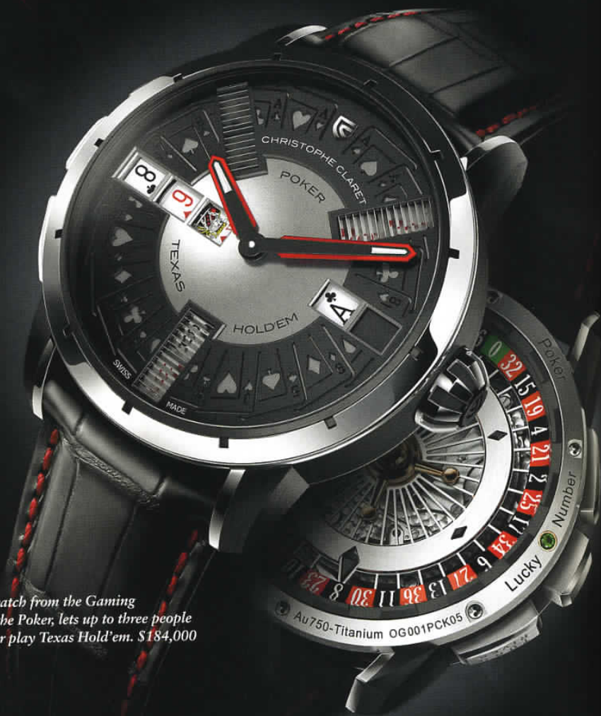
The third watch from the Gaming collection, the Poker, lets up to three people and a dealer play Texas Hold'em. $184,000

The game begins by pressing the pusher at 9 o'clock to shuffle and deal the cards. Each player sees two cards in separate windows with specially designed blinds that prevent them from seeing