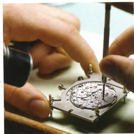
Assembling a 21 Blackjack at the Claret factory