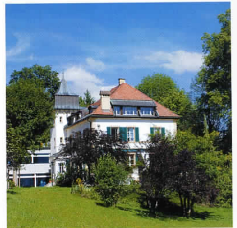
The Christophe Claret manufacture is on the outskirts of Le Locle in a renovated villa called Soleil d'Or.