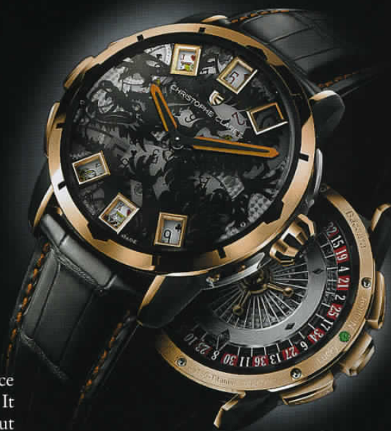
The Baccara is a mini-casino, with cards, dice and baccarat games. $223,000

In 2012, Claret unveiled the second piece in his Gaming collection, the Baccara. It also plays cards, dice and roulette, but instead of blackjack, it deals a game of baccarat ( baccara in French and Italian). The goal in baccarat is to come as close as possible to nine points with two of three cards. The Baccara is available in nine different versions, each limited to nine pieces and all with either a dragon or a tiger on the dial.