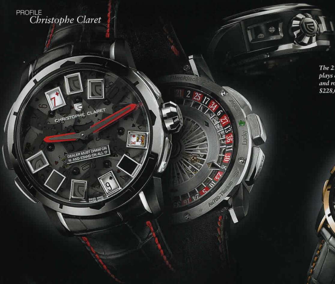
The 21 Blackjack plays cards, dice and roulette. $228,000