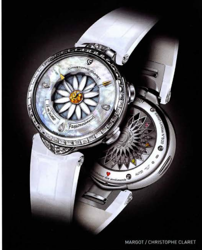
MARGOT / CHRISTOPHE CLARET